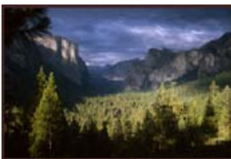
HM - "Yosemite" - Al Kok