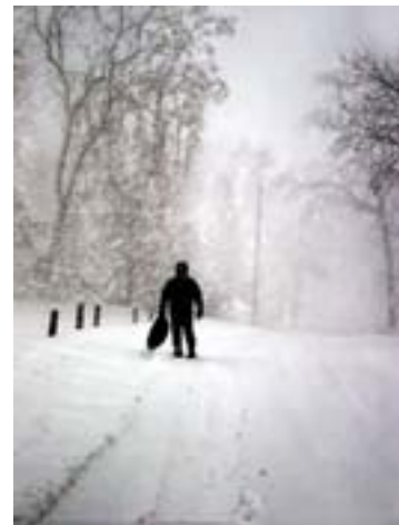
3 rd Place - "Blizzard Standing" - Michelle Barkdoll