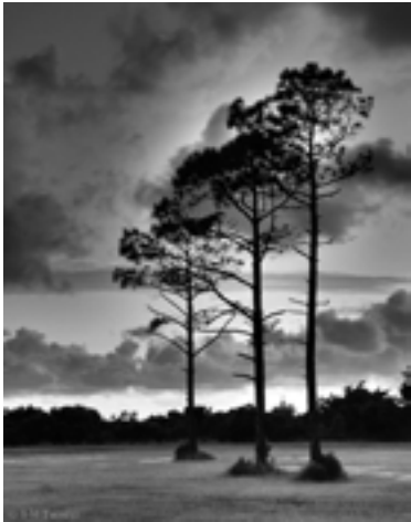
1 st Place - "Bodie Island Trio" - Mike Thomas