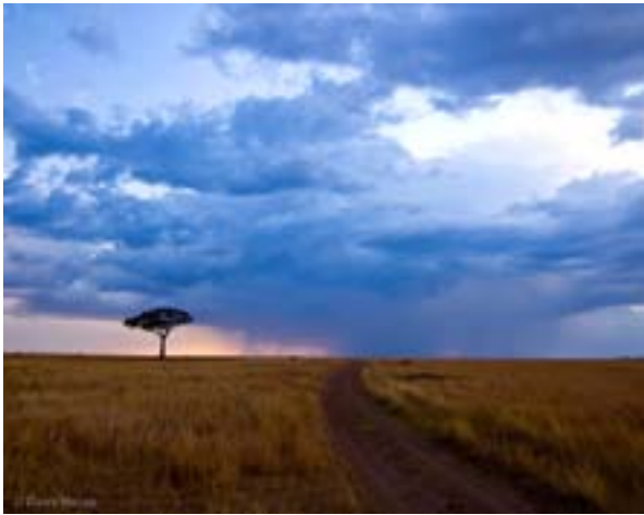
1 st Place - "Mara Landscape" - Dawn Miller