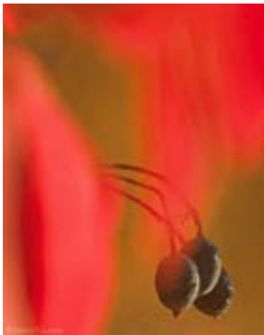
3 rd Place - "Red Leaves, Blue Berries" - Chuck Gallegos