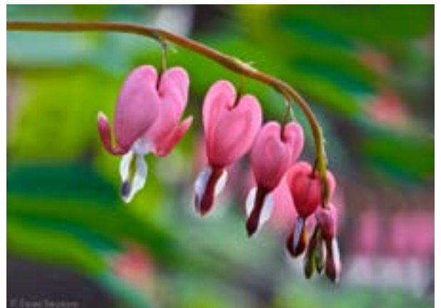
HM - "Bleeding Hearts" - Ernie Swanson