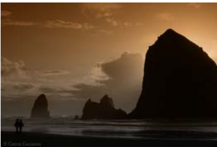
HM - "On The Beach" - Chuck Gallegos