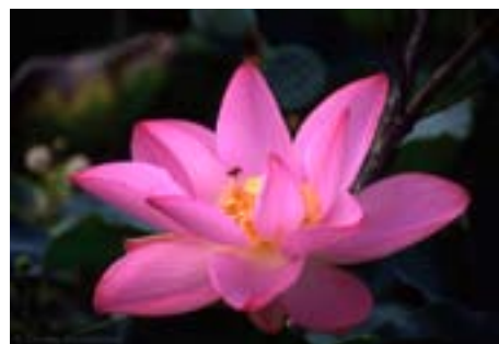
HM - "Coming In For A Landing" - Dolphy Glendinning