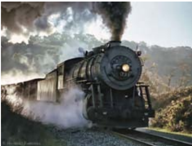
3 rd Place - "Morning Steam" - Michelle Barkdoll