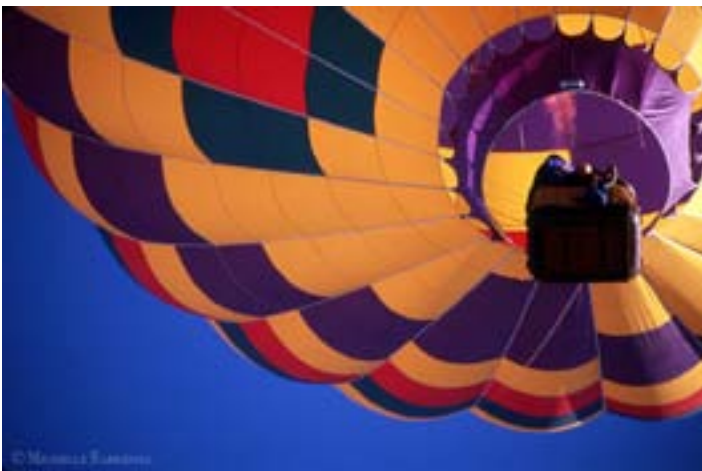
3 rd Place - "Flying High" - Michelle Barkdoll