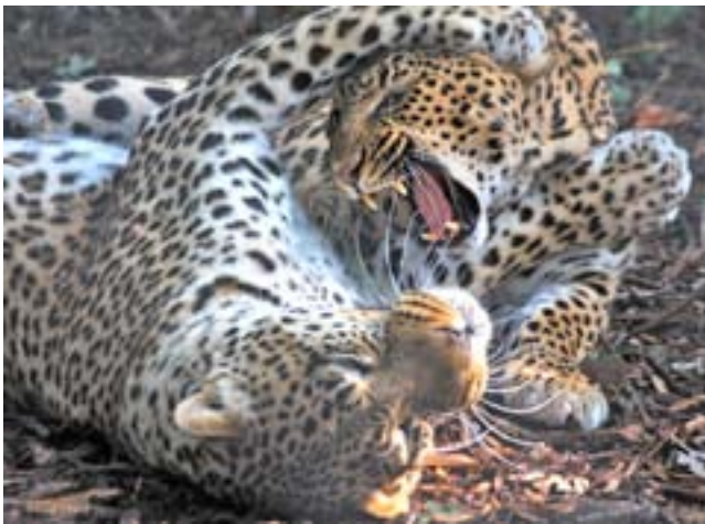
3 rd Place - "Love Spat" - Howard Penn