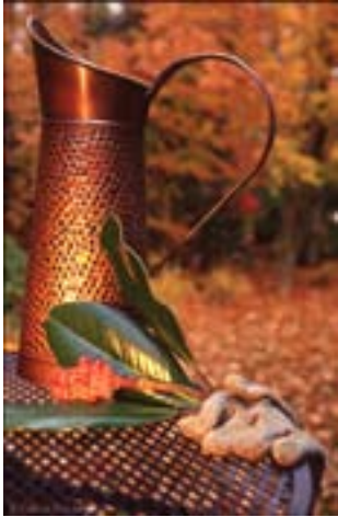
1 st Place - "Autumn Arrangements" - Chuck Gallegos