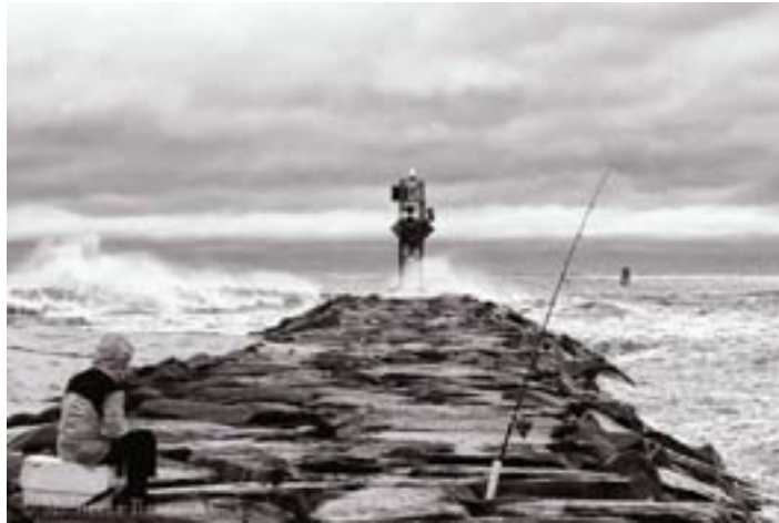
1 st Place - "Fishing In The Storm" - Michelle Barkdoll