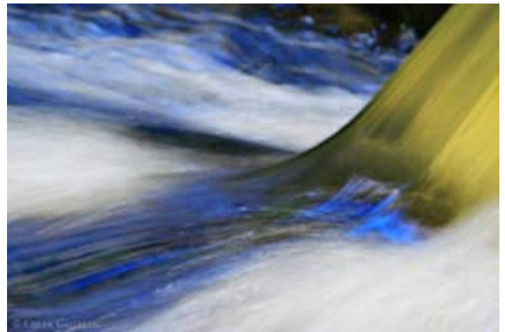
4 th Place - "Woosh" - Chuck Gallegos