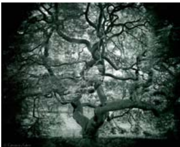
4 th Place - "Tree" - Charles Graf