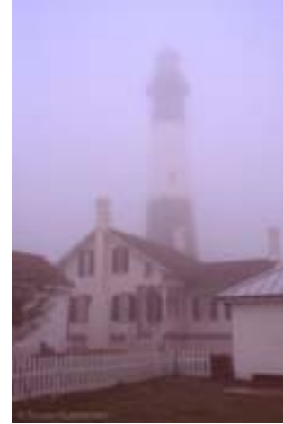
2 nd Place - "Fogged In" - Dolphy Glendinning