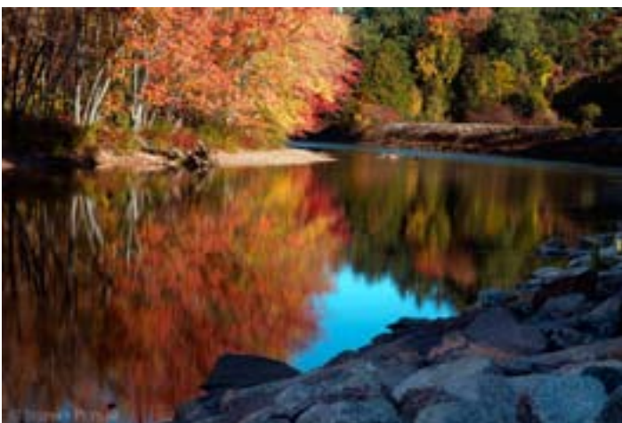
HM - "Autumn In New Hampshire" - Stephen Putnam