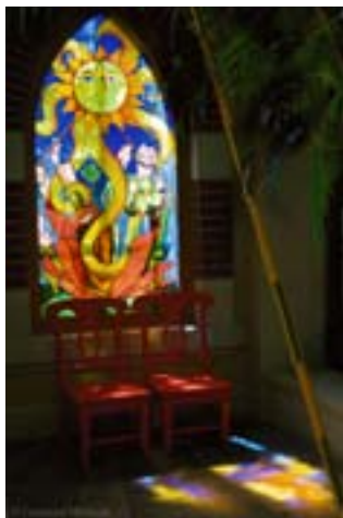
3 rd Place - "Sunny Reflections" - Christine Metzgar