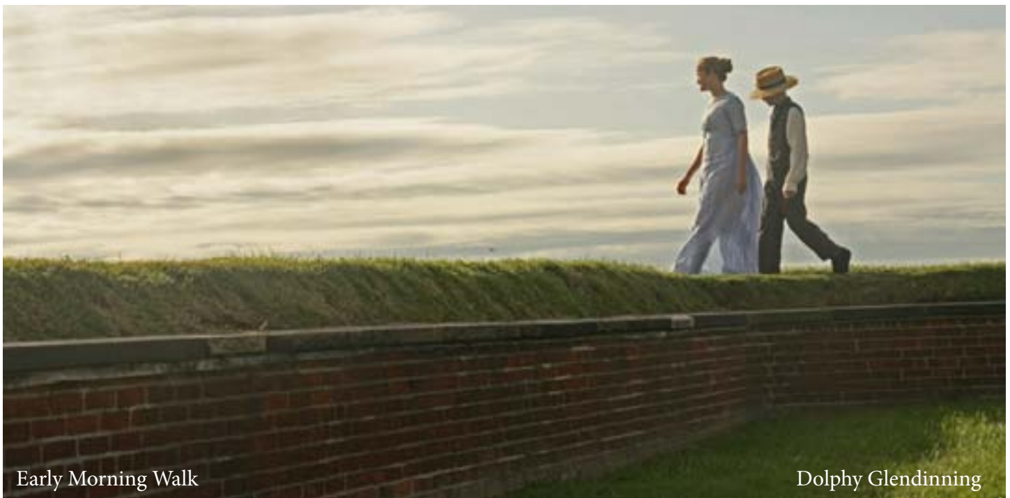
Early Morning Walk