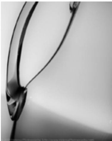
2 nd Place - "Tilt" - Michelle Barkdoll