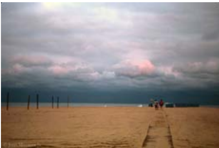
HM - "Boardwalk"