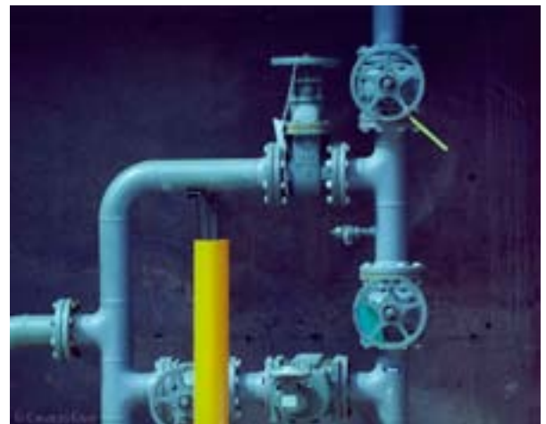
4 th Place - "Colorful Plumbing" - Charles Graf