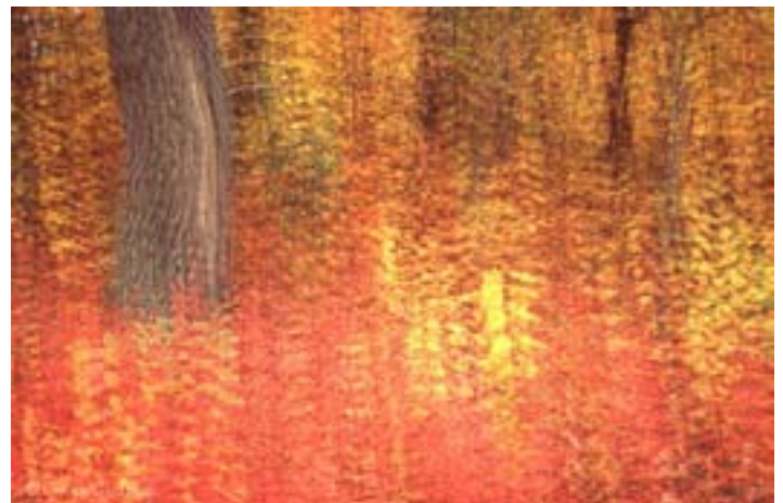
HM - "Quaking Blueberries" - Chuck Gallegos