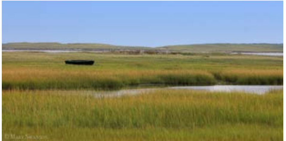
2 nd Place - "High and Dry" - Mary Swanson