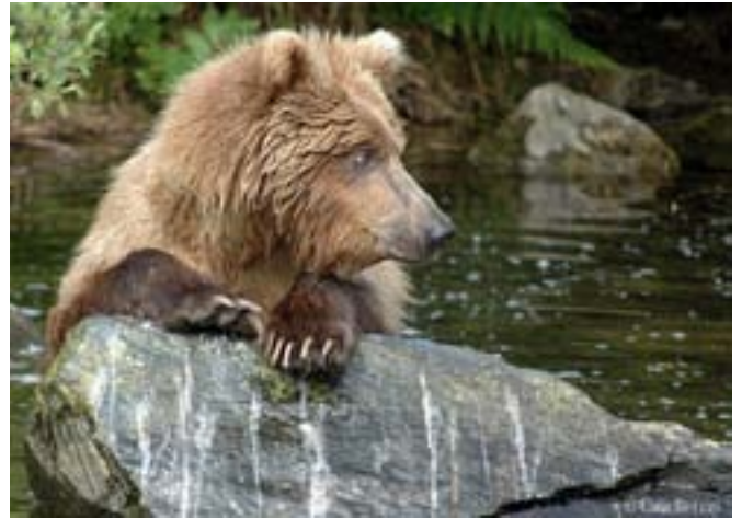
2 nd Place - "Grizzly Details" - Chip Bulgin