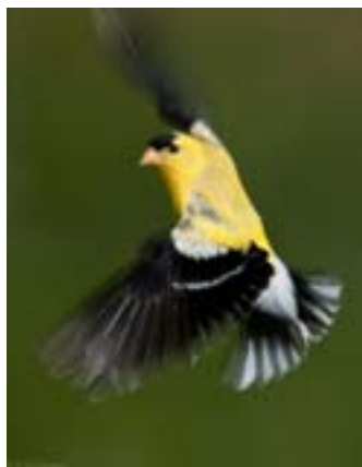
HM - "Male American Goldfinch"